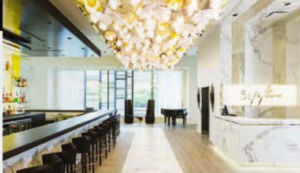
Contour Interior Design implemented brass shelving, backlit panels and blossom lighting inside 51fifteen's bar for a contemporary look.