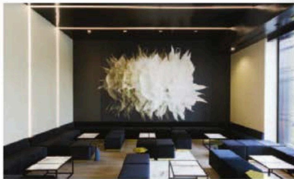
The new 8,500 square-foot restaurant 51fifteen includes a variety of custom pieces all designed by Contour Interior Design.

Contour Interior Design opened in 2007 in Houston and in Miami in 2014. Together, both locations feature a 10 person staff, including Magon, and each team member "excels in a specialty whether it be in details, construction documents, procurements or even creativity," Magon said.